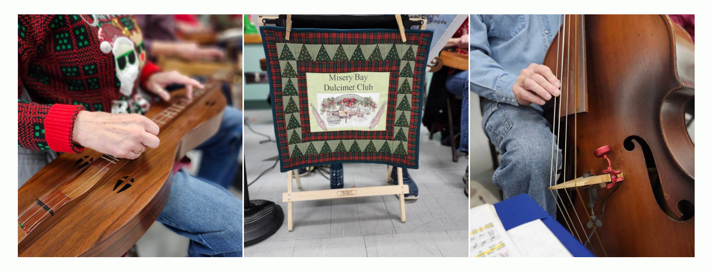
Enjoy these photos!

These photos are of part of the Misery Bay Dulcimer Club's visit in early January. The Appalachian dulcimer is one of the easiest instruments to learn and many variations of the instrument can be found worldwide. Producing a very lovely, soft sound is often referred to as "sweet sounding" and has roots in all-American folk music.